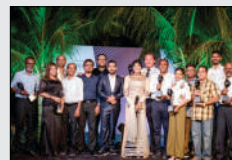
Cover Photo : A picture of a previous edition of Maldives Travel Awards ceremony

National Boating Association of Maldives G. Maavehi (2 nd Floor), Buruzu Magu, Malé 20092, Maldives Hotline +960 797-0033 Tel +960 330-0640 +960 330-0630 Email info@boating.mv