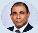
Dr. Abdulla Mausoom Minister of Tourism