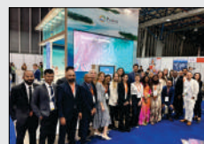
Cover Photo : A picture of MMPRC participants at KITF 2023 To Promote the Maldives in Kazakhstan

National Boating Association of Maldives G. Maavehi (2 nd Floor), Buruzu Magu, Malé 20092, Maldives Hotline +960 797-0033 Tel +960 330-0640 +960 330-0630 Email info@boating.mv