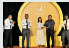
Cover Photo : During the Gala ceremony of the Maldives Boating Awards 2022

National Boating Association of Maldives G. Maavehi (2 nd Floor), Buruzu Magu, Malé 20092, Maldives Hotline +960 797-0033 Tel +960 330-0640 +960 330-0630 Email info@boating.mv